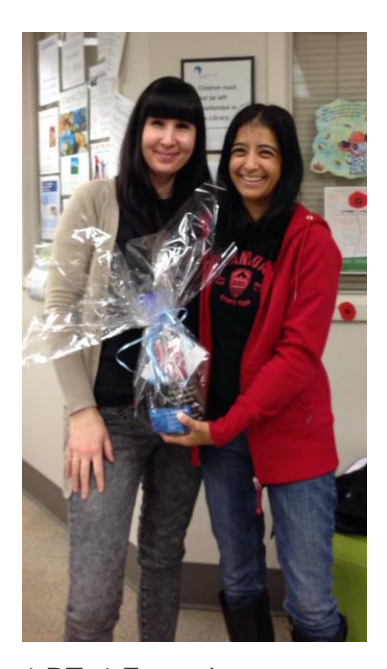
1 RT, 1 Favourite